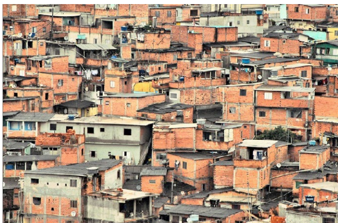
Figure 2 Favela in Brazil