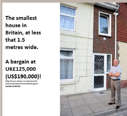
Figure 1 The smallest house for sale (Geoffrey Payne)

Payne showed an image of a man in the United Kingdom standing outside his 1.5 metre wide house in London which was on sale for £125,000 (fig 1). He used this example in a presentation for Ugandan government officials, who insisted that plot sizes of 150 m 2 were needed, even though this would make it impossible for a large proportion of Kampala's population, many of whom lived on plots of about 60m 2 , ever to become legal residents.