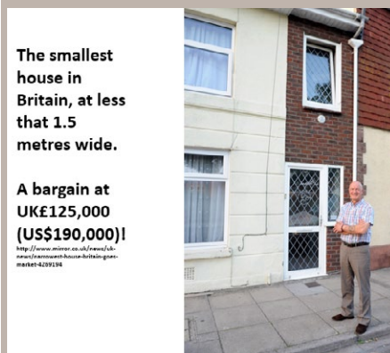
Figure 1 The smallest house for sale (Geoffrey Payne)

Payne showed an image of a man in the United Kingdom standing outside his 1.5 metre wide house in London which was on sale for £125,000 (fig 1). He used this example in a presentation for Ugandan government officials, who insisted that plot sizes of 150 m 2 were needed, even though this would make it impossible for a large proportion of Kampala's population, many of whom lived on plots of about 60m 2 , ever to become legal residents.